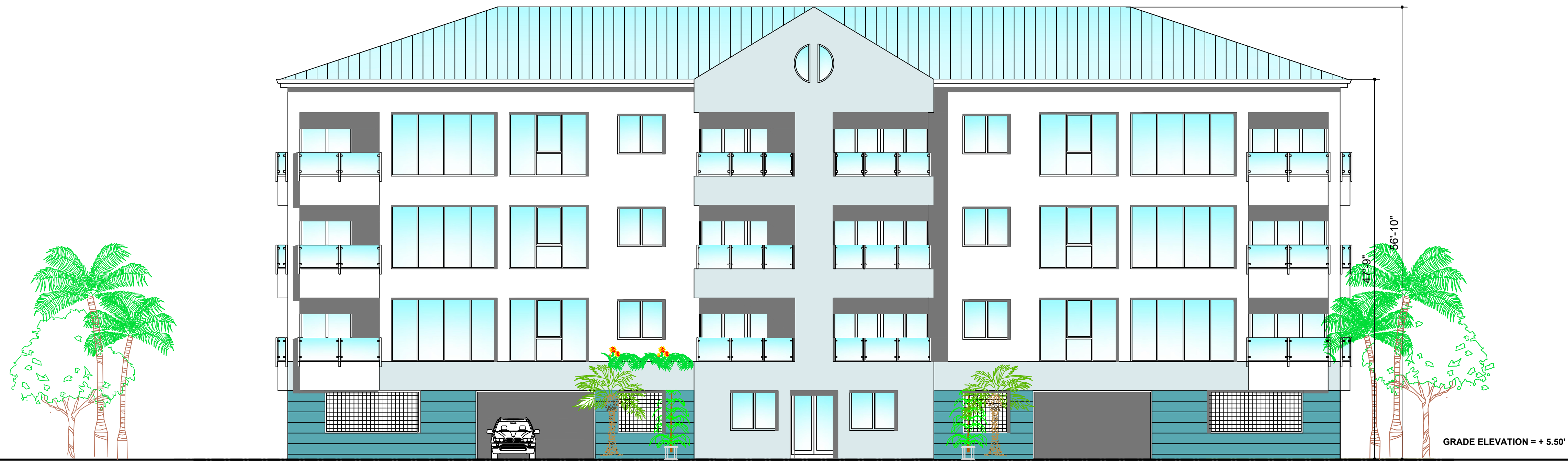
WEST (REAR) ELEVATION